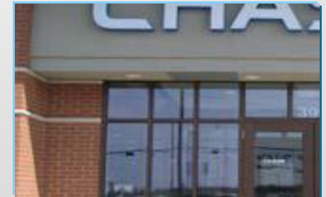
2008: 10 Banks receive threatening letters, some containing white powder