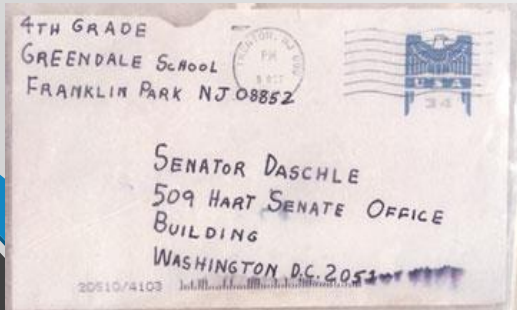
2001: Contained anthrax sent to Senator Daschle

Shut off HVAC system if facility has emergency shut down switch