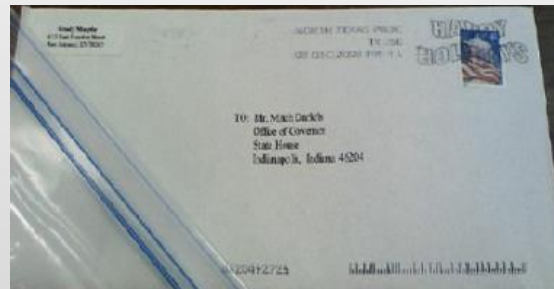
2008: Letters sent to Governor's office, some contained white powder