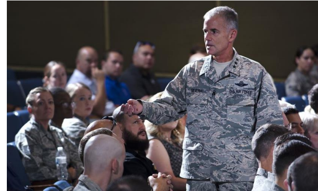
Lt Gen Jay Silveria

As you become oriented to USAFA's mission, take a moment to locate and review USAFA's Strategic Plan.