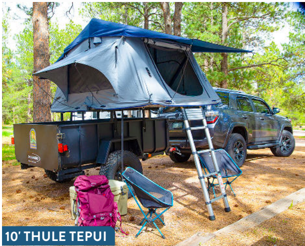
10' THULE TEPUI