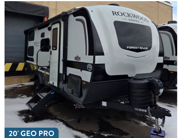
20' GEO PRO